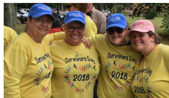
Pictured above: DKH Oncology nurses at the 2018 Cancer Survivors Picnic.

Accepting the status quo is not an option at DKH. Our commitment to be better, fueled by the investment and commitment of our community is what keeps us moving forward. We take great pride in the fact that our community has fostered the evolution of this unique and historic institution and look forward to engaging the community in support of this campaign for the enhancement and expansion of cancer services, and the next evolution of care at DKH.