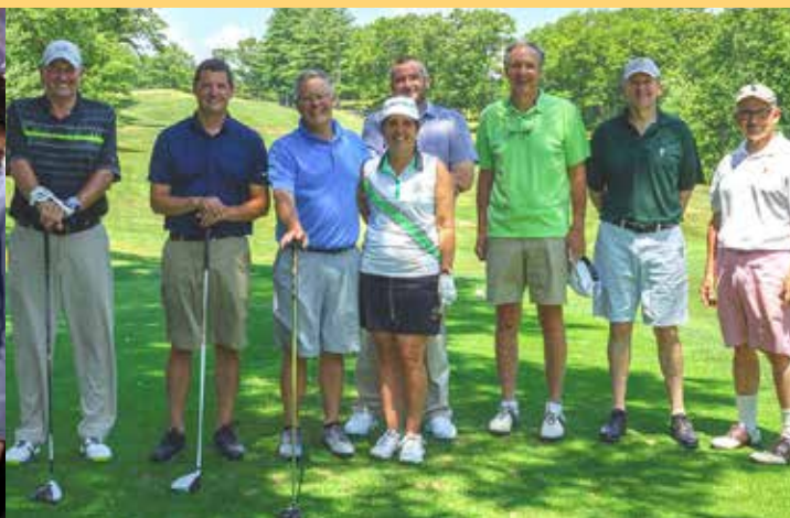
Over 250 golfers, volunteers, and guests were in attendance at CT National Golf Course for the DKH Putnam Bank Classic on July 12. More than 130 local and regional businesses and organizations participated in sponsoring the event with title sponsor Putnam Bank leading the way for the 2nd year in a row with a $25,000 contribution. Pictured are special guest Coach Jim Calhoun (far left) with members of the Putnam Bank and DKH foursomes.